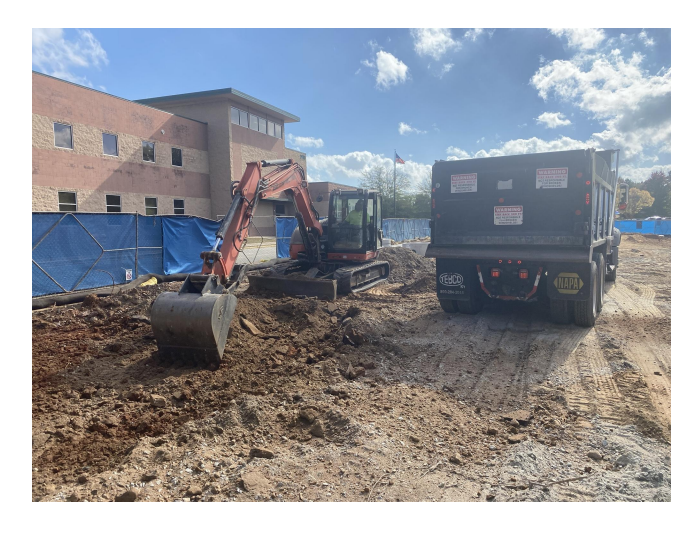
Grading Parking Lot