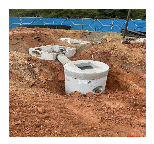
Storm Pipe E2 installed